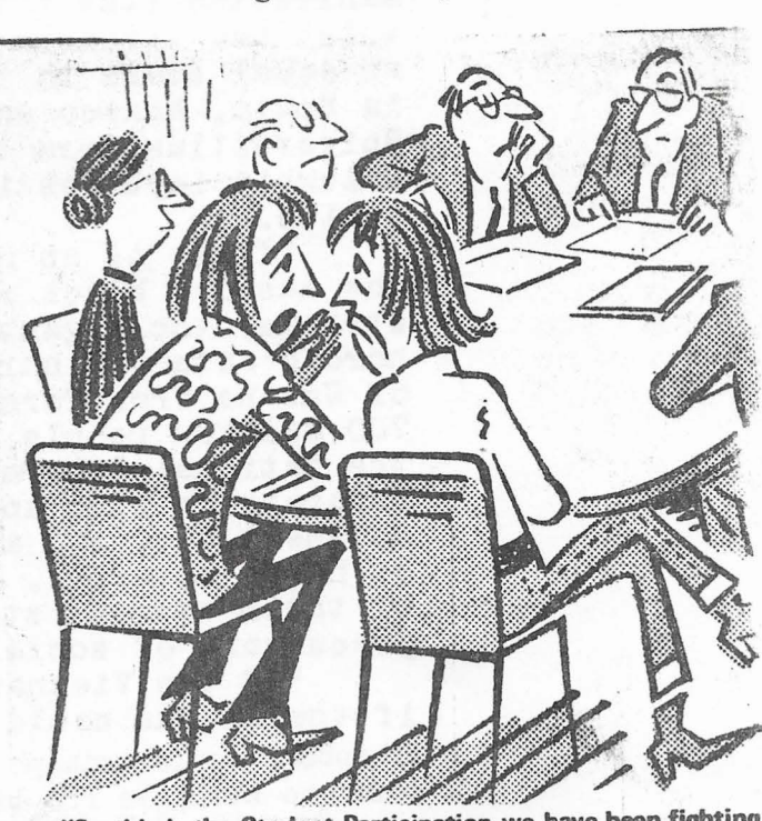
"So this is the Student Participation we have been fighting for. Man, what a drag."

if the fingerfuckin snitchsnatch was to be directed at an innocent bystander what wood you do wood you scream or at least make an attempt to escape such a horrid fate that is worse than non-living entities who inhabit the sea and go down to heaven at night. the college population are all hung down about the reason that they were not all acceded to the point that the new youk football season the jets who go to austrailia very fast and certainly do their thing quite well meanwhile the other factor that was intricately discussed in the elaborate think tank brainstorming center of creative endeavors, one last point of discussion that must be an extrinsic, albeit important aspect of the following primal mysticism is when the airplane that flew at the fillmore played the kite of stretchy fluid interspersed with the cunningilus fate.