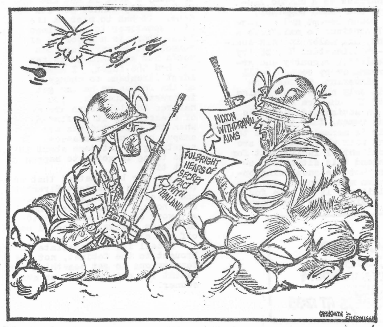
"I bet that's how they plan to get us out of Vietnam. They're going to send us all to Thailand."