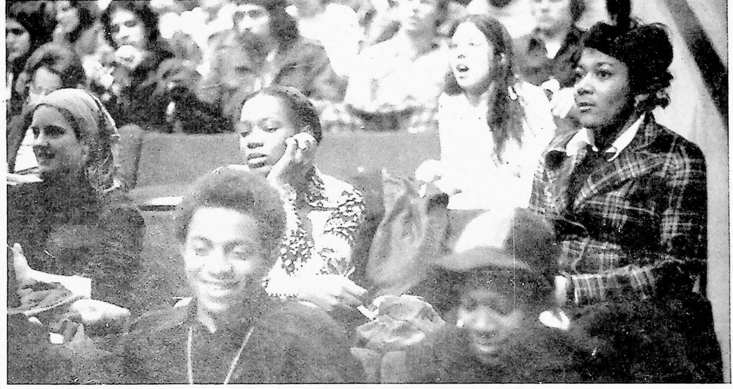
SICC Students in Give-and-Take Session With Albany Legislators

As far as the nominal fee argument is concerned, this is treacherous - history has shown that tuition does not go down but it increases at such a rate as to price the poor out of higher education. Have you noticed the ever increasing fees presently attached to our education which were not heard of a year ago e.g.: