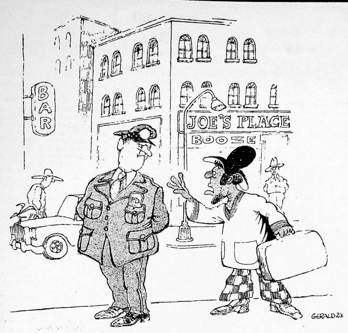
"PARDON ME, OFFICER, BUT I KNOW YOU CAN HELP ME - DIRECT ME TO THE NEAREST DOPE JOINT IN THIS TOWN."