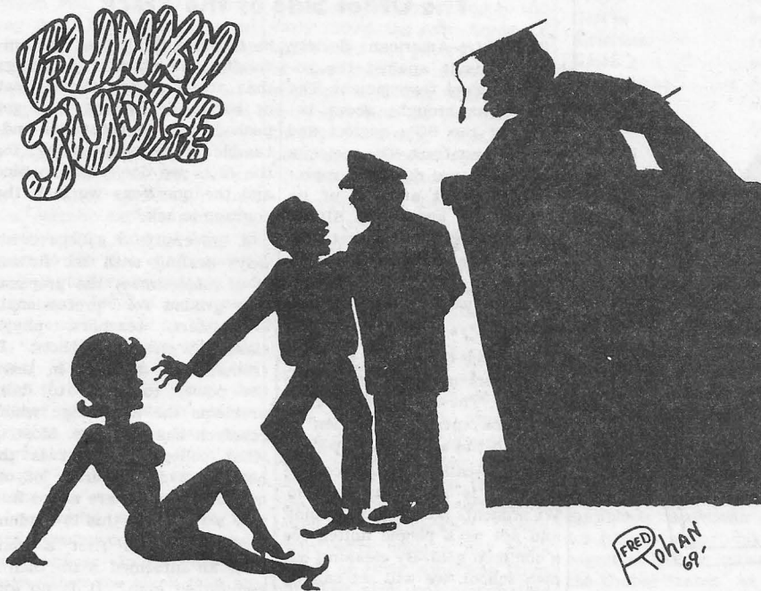
"Well, ya honor, I see it this way: If a man's goin' to be sentenced for statutory rape, he might as well finish the job."