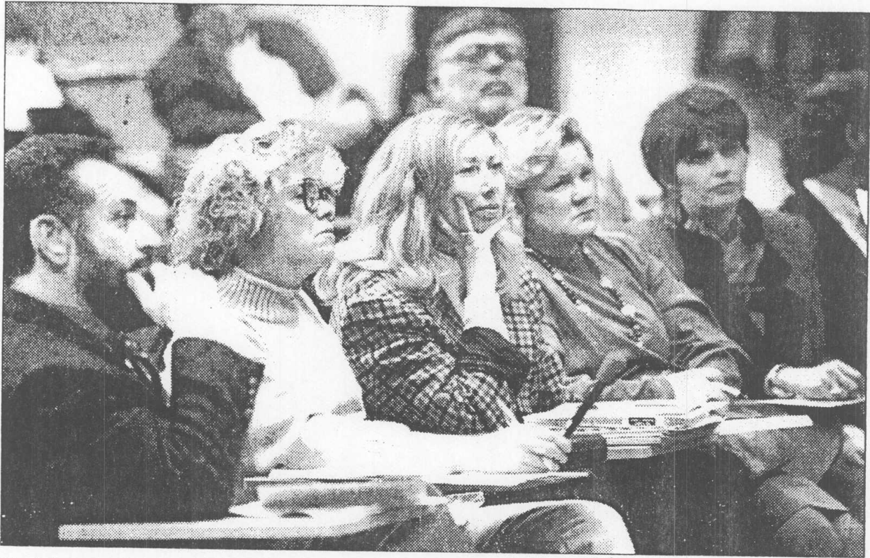
Disabilities professionals listen to stories about the former Willowbrook State School.