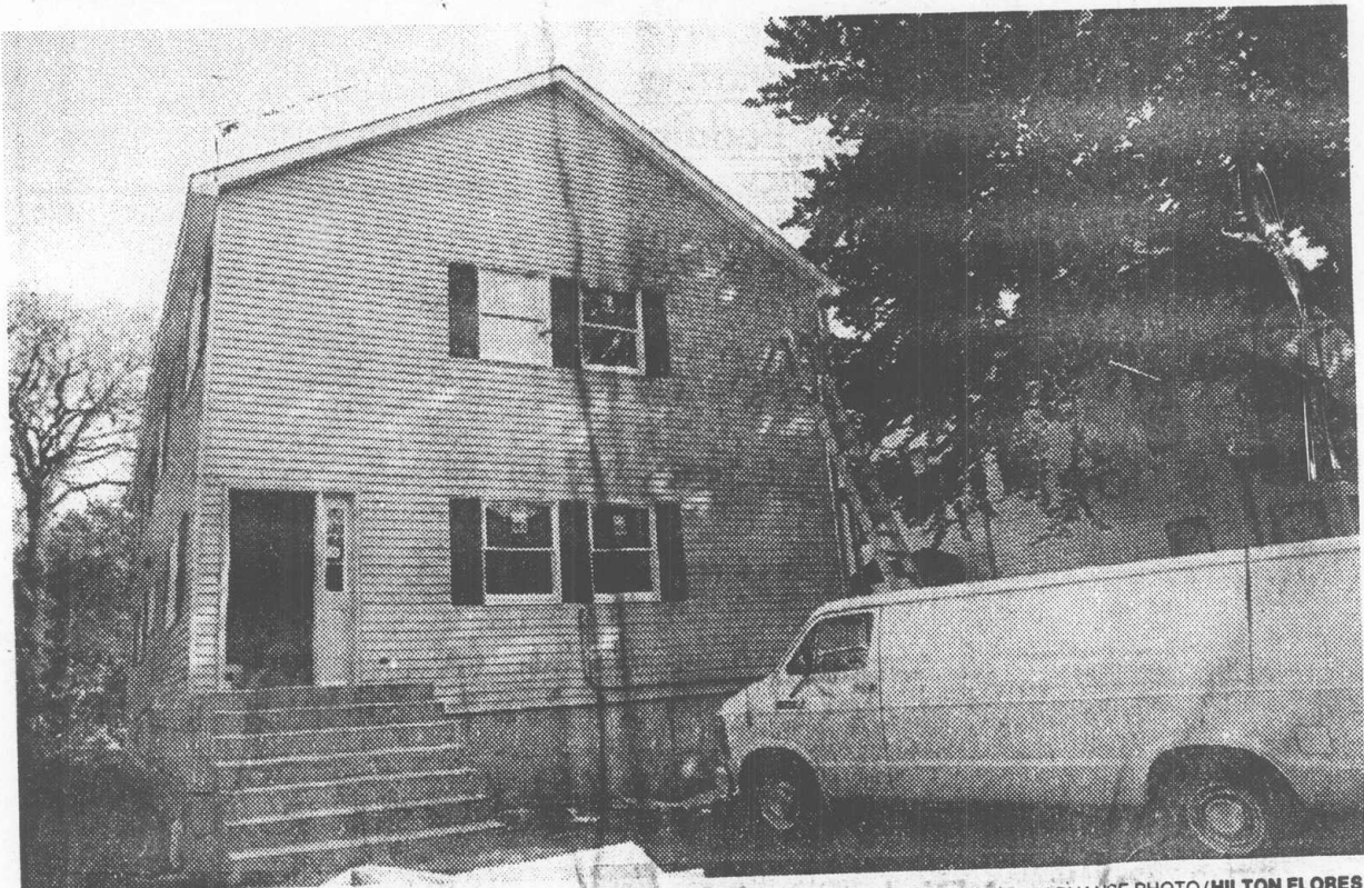
The house under construction on Faber Street in Port Richmond is being targeted as a group home for the retarded