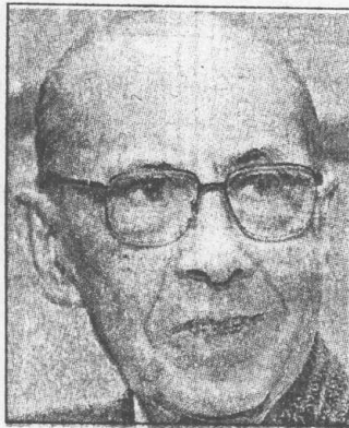
State Sen. Vincent Gentile (D-Brooklyn/East Shore)

"The most concrete method you can pursue as a legislator is to vote budgetary support [for such programs] and I do consistently."