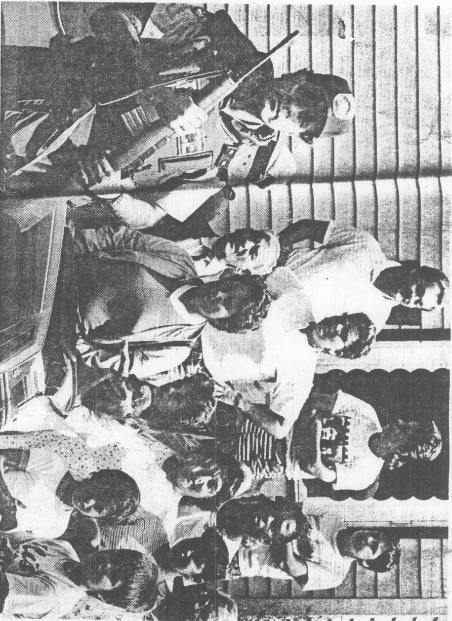
A SWAT team police officer stand before the crowd outside the Stapleton Criminal Courthouse.