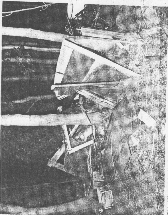
Old milk crates and pieces of plywood litter the campsite.