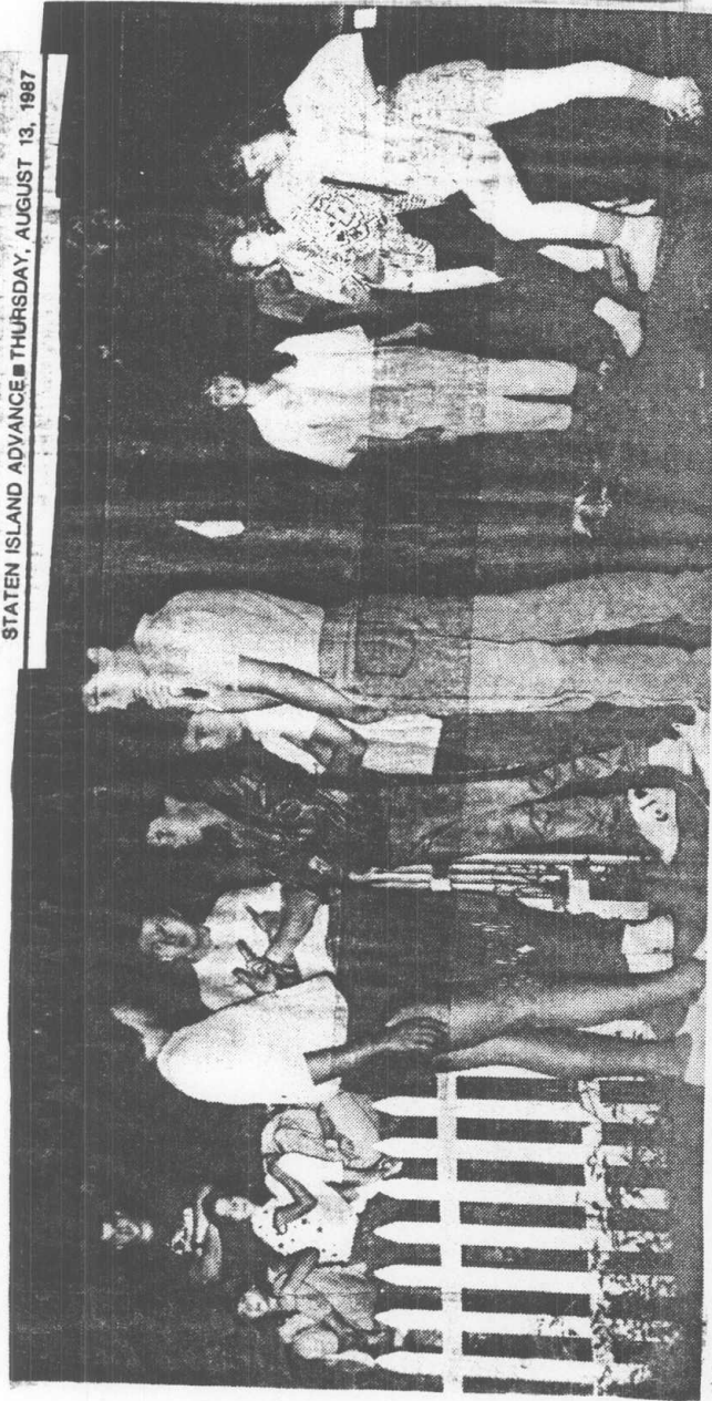
Friends and neighbors of the Schweigers stand and wait word about Jennifer.