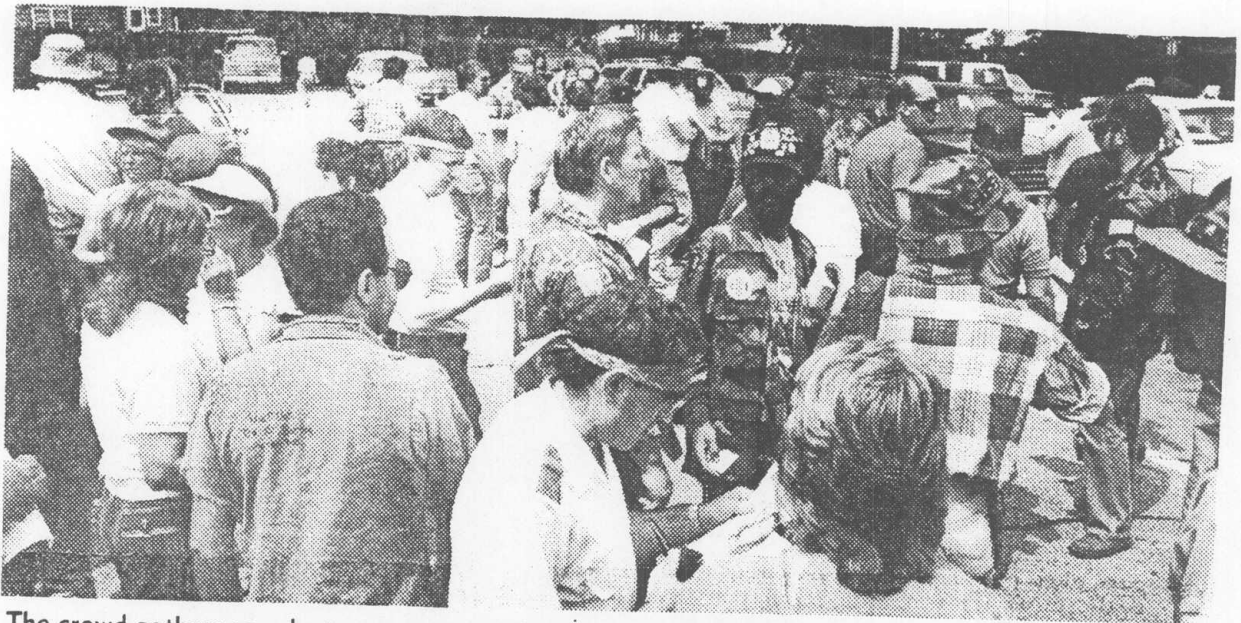
The crowd gathers as volunteers prepare to begin a day of combing the area for any sign of the girl.