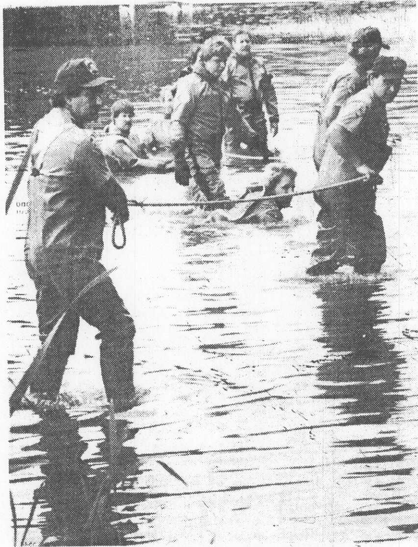
Divers from the Emergency Services Unit and Harbor police drag the bottom of Willowbrook Pond.