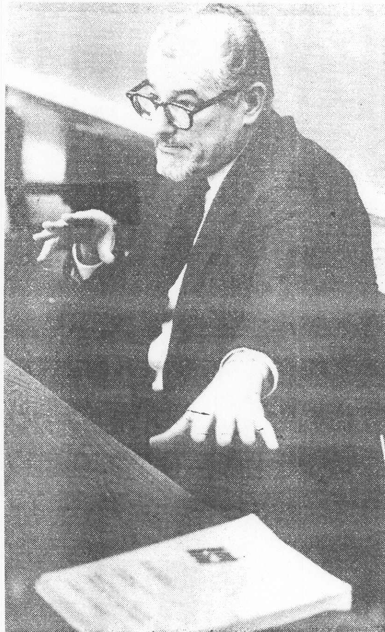
Volpe refers to the study on CSI's location.

Another public hearing on the unified campus, conducted by Community Board 2, will be held Feb. 13 at 7:30 p.m. at Sea View Hospital and Home. The board is inviting Islanders to voice their opinion whether the college should be located in Ocean Breeze or Willowbrook, although Community Board approval is not necessary for the move.