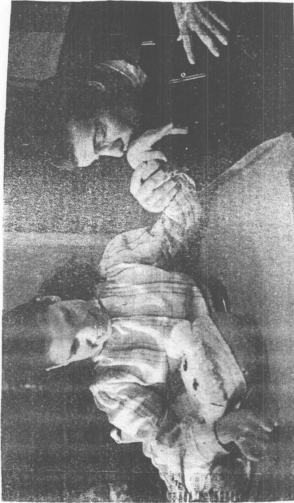
Two residents of a group home in Oakwood share a tender moment.