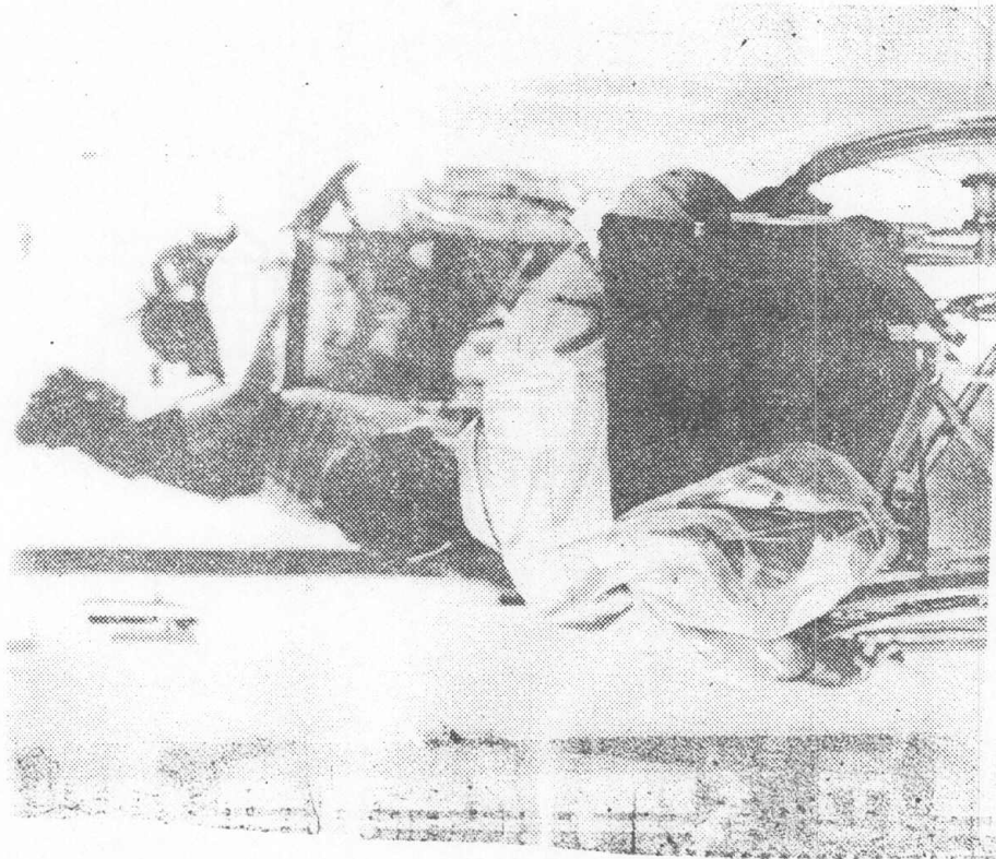
All the residents in the Medina Street group home are in wheelchairs.