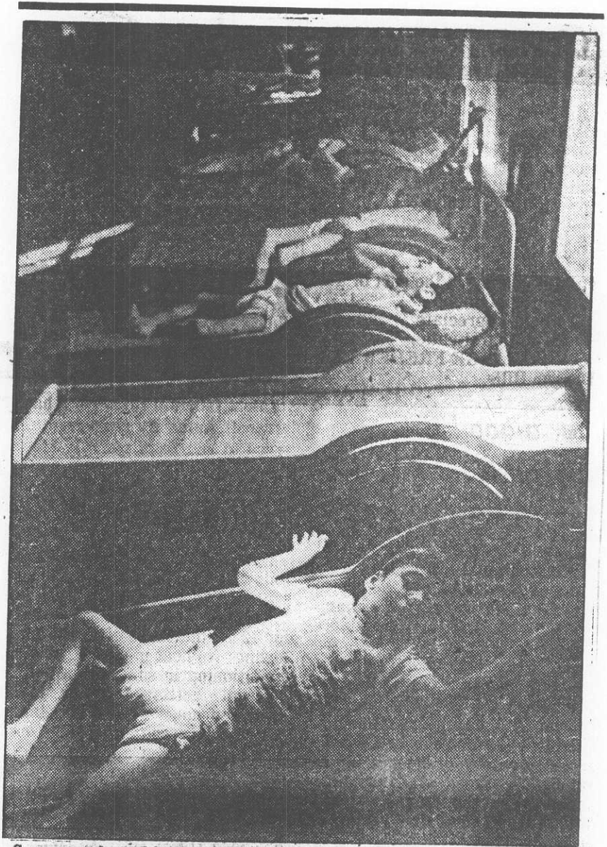
Scenes such as this were commonplace at Willowbrook State School prior to a court-mandated reform of the institution developed in 1975. Now a federal court judge has said care at the facility remains inadequate.

There is no doubt that the state must be monitored and must be