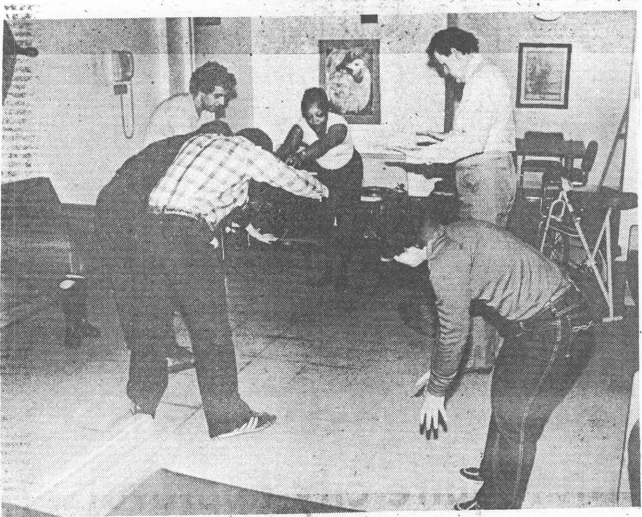
Residents of a group home at 630 Hylan Blvd., Grasmere, do daily exercises in their finished basement.