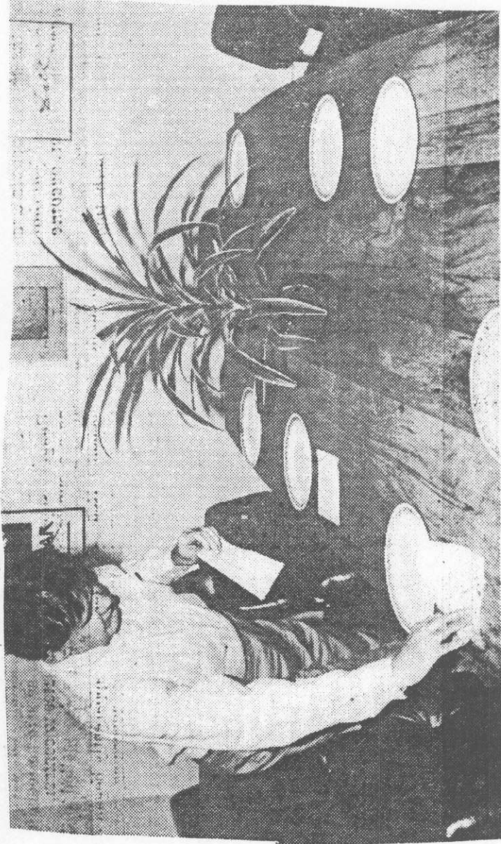
Every resident of the group home shares in household chores, including meal preparation.