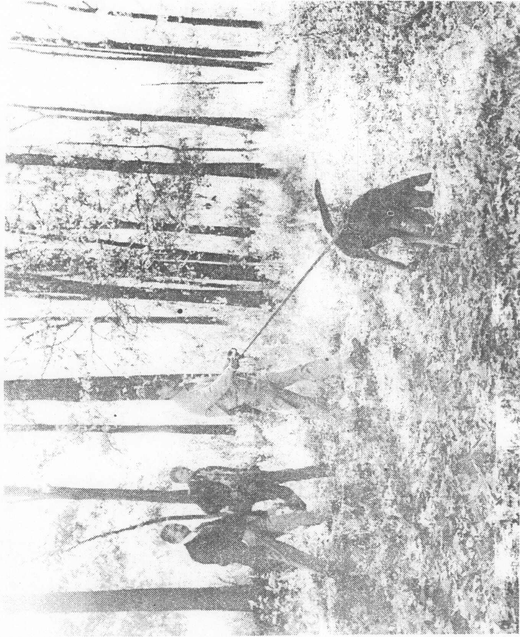
A state trooper with a bloodhound leads detectives through a wooded area in search of a missing Staten Island