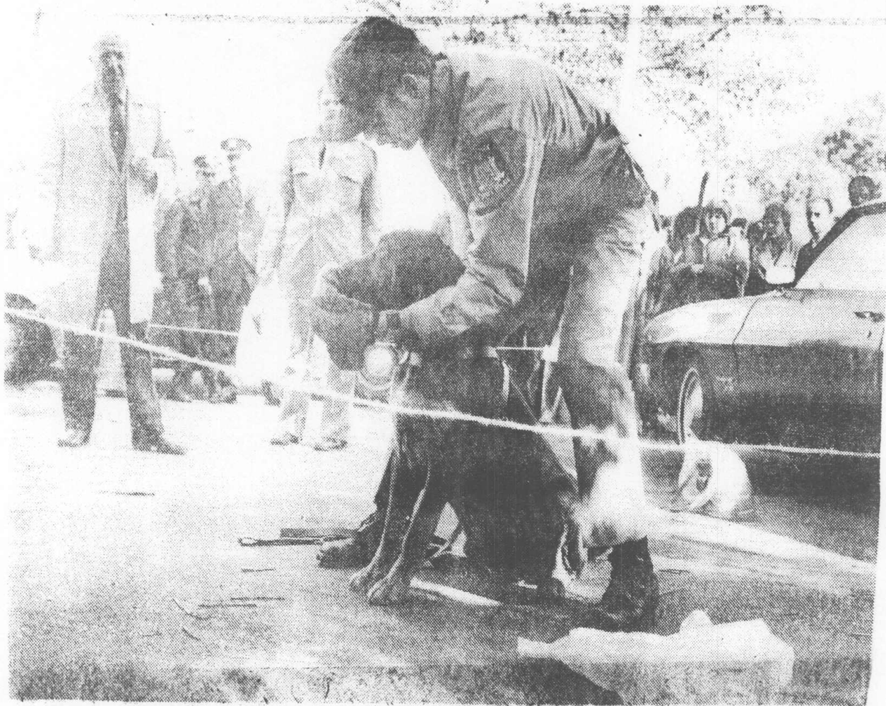
A bloodhound picks up the scent of the missing woman from a shoe found on the ground.