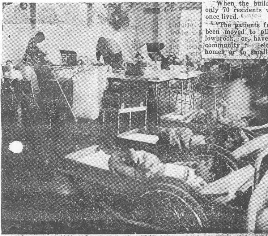
A typical area of Willowbrook that is being renovated and where overcrowding will be eliminated and services improved.

Slawinski views "the marriage of the two projects, as one of perfect timing."