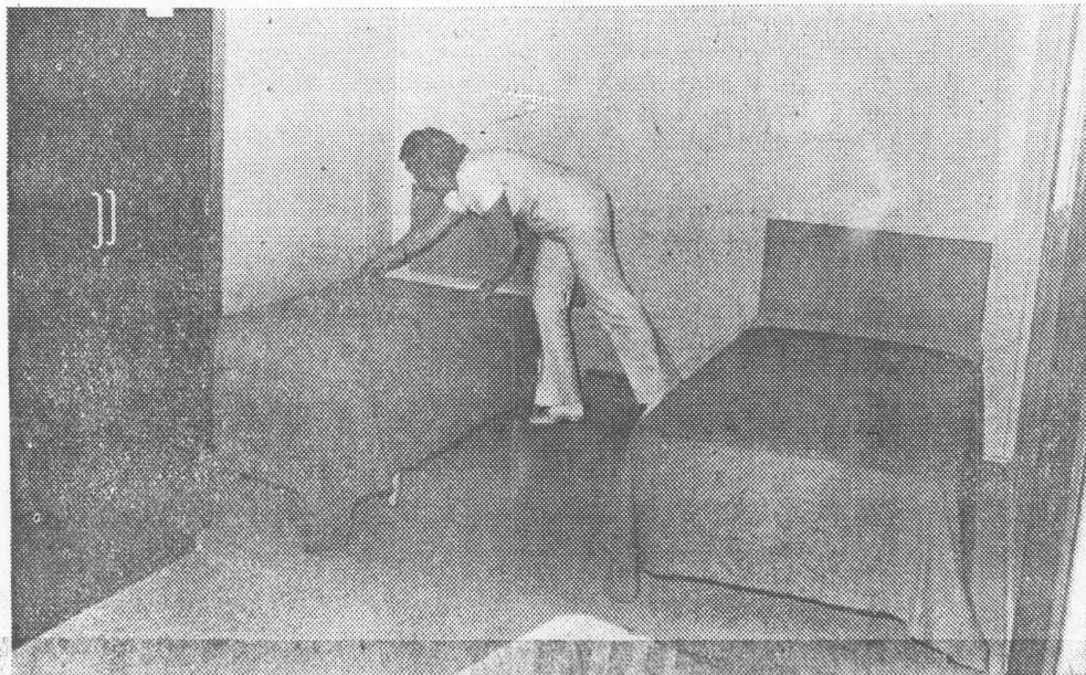
An attendant at Willowbrook Developmental Center prepares a bed in one of the rooms in Building 78.