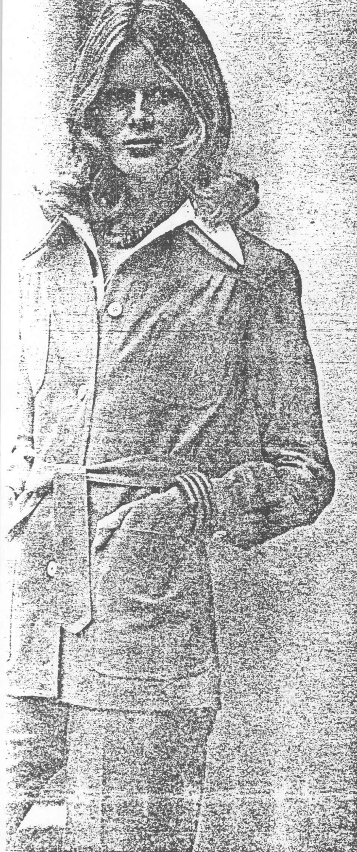
The Jones Shantung suit. A polyester and rayon in blush and other about $23. Floral printed nylon shirt in blue or persimmon. About $22. J. & Taylor, New York; Garfinckel's, Washington, D. C.; Ivey's of Raleigh; Ivey's, Chicago.