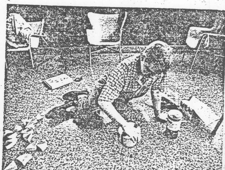
A patient at Bronx State Hospital, where a recent director "went about doing, as a matter of medical policy, precisely what the lawyers demand be done as a matter of law."