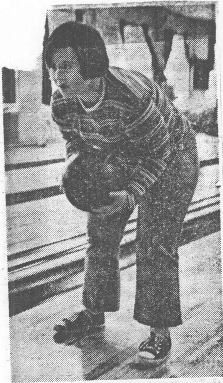
A resident of Willowbrook learns to enjoy the sport of bowling thanks to the program.