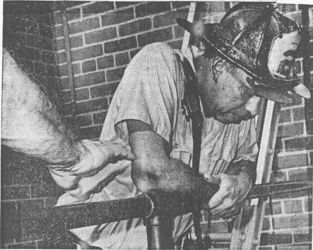
A fireman rests after fighting the three-alarm basement fire in Willowbrook State School.