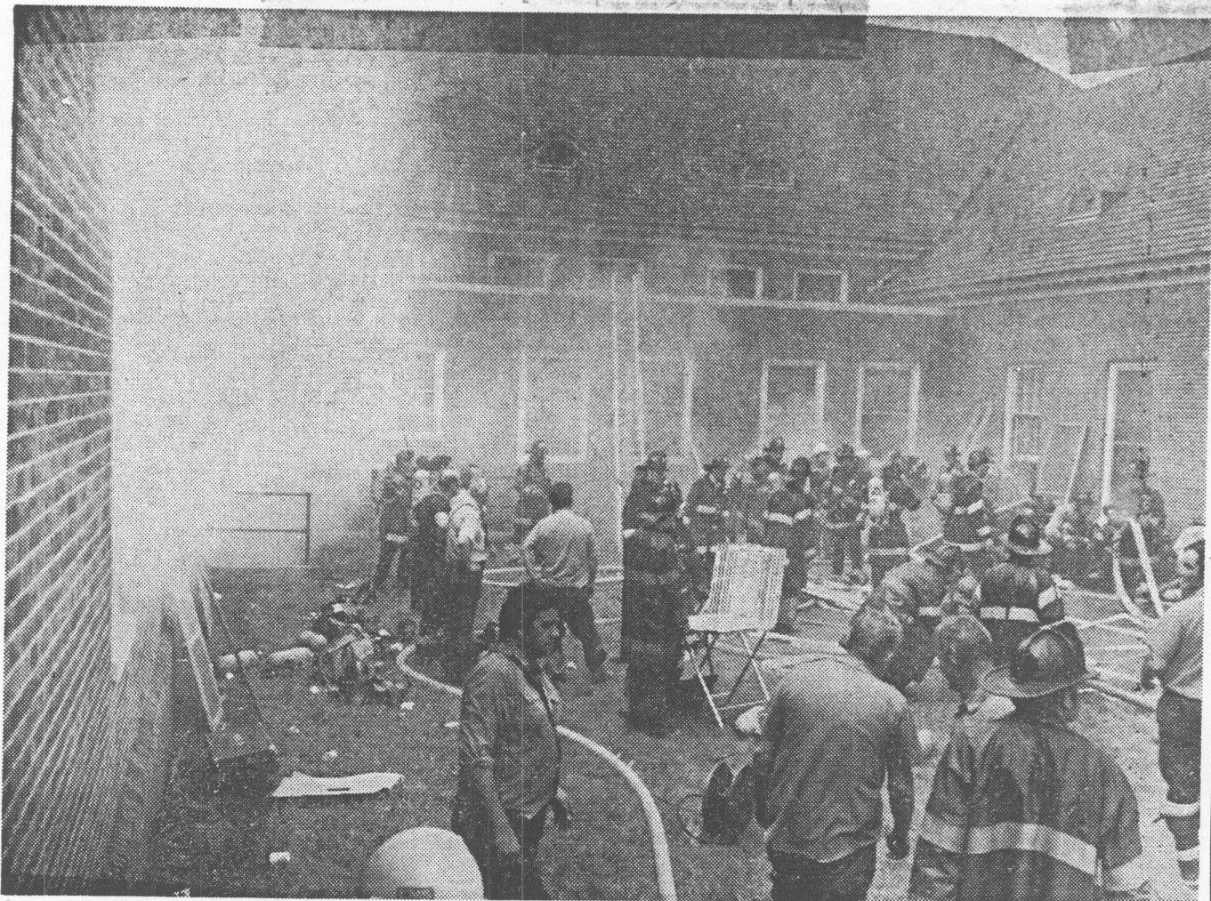
Firemen assemble in front of Building No. 4 at the Willowbrook State School to fight the three-alarm blaze there. The fire raged out of control for more than three hours.