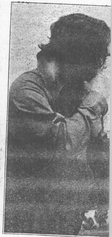
After dinner, the