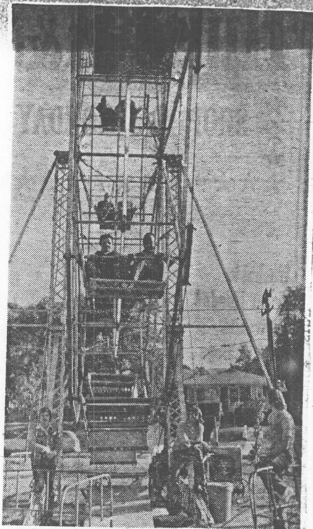
Willowbrook patients get a brand new view of Staten Island from the Ferris wheel, a popular ride.