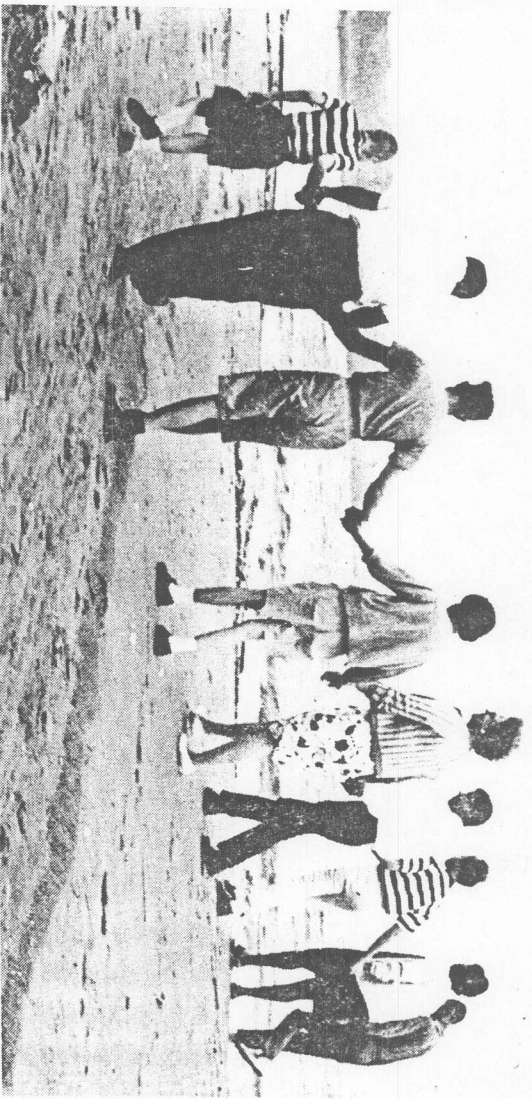
A stroll along the beach at Wolfe's Pond Park is another treat. Field trips are made possible through a federal grant to the school, which also provides for remedial education and other learning programs.