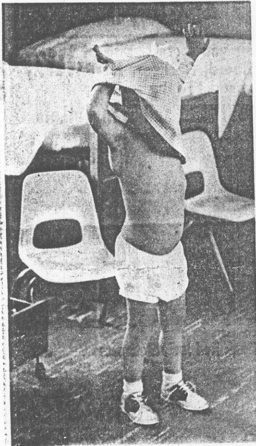
Many of the children in the intensive training program learned to dress themselves in a few months.