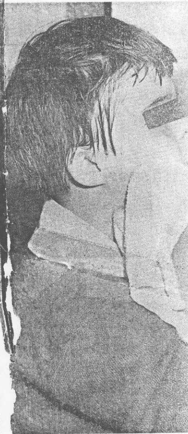
Self-help for young Willowbrook State School children begins with clean face and hands.