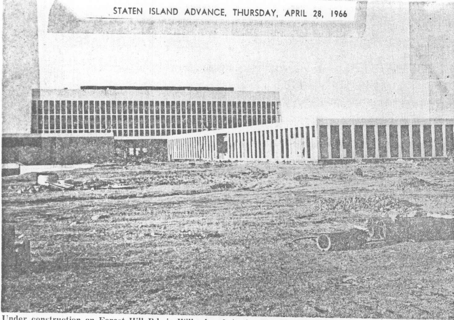
Under construction on Forest Hill Rd. in Willowbrook is the $7-million Institute for Basic Research in Mental Retardation.