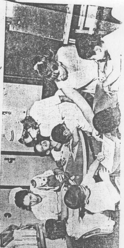
Children at Willowbrook State School are seen in a classroom. The institution has nearly 2,500 employees.