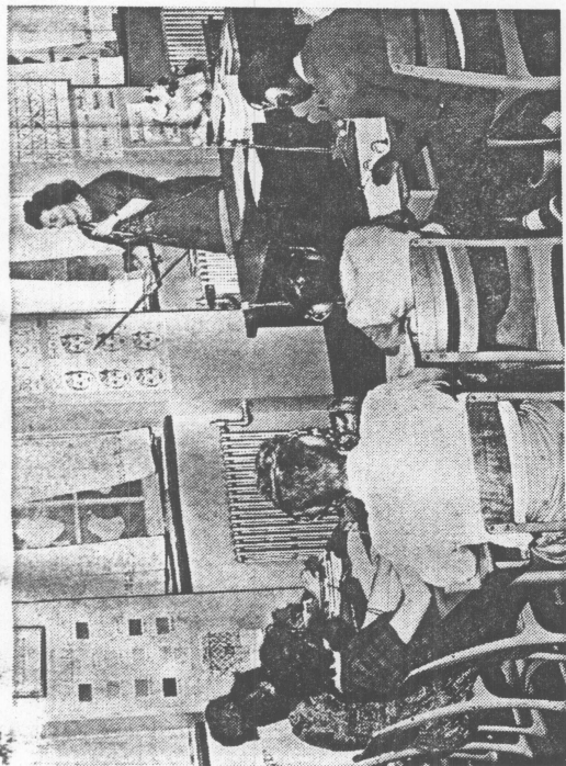
Deaf children get special comprehension lessons.