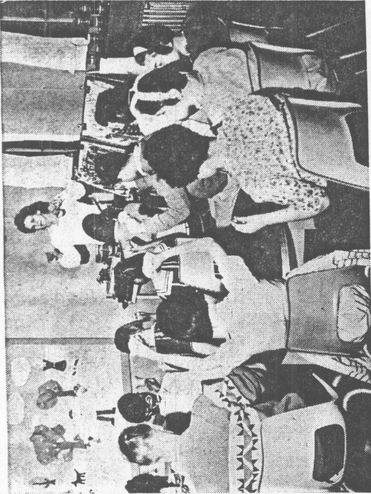
Blind students sing, paint, color and even make cutouts at the state school.