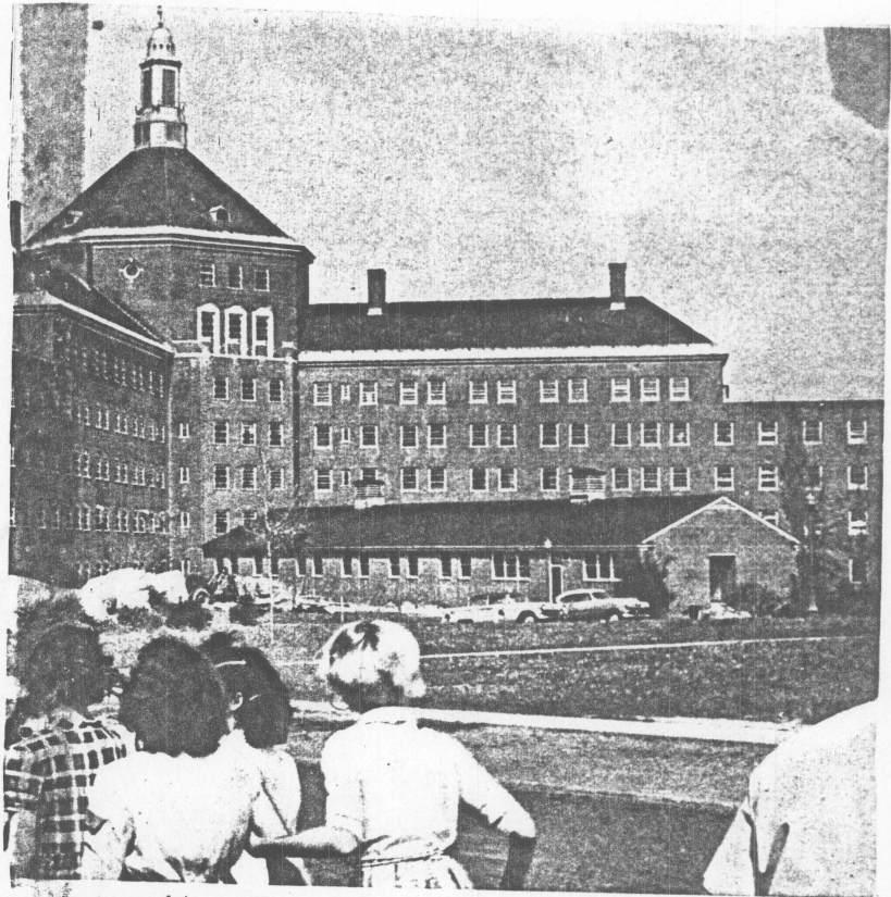
treatment of the sick. This state institution cares for close to 6,000 mentally retarded patients