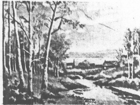
Every nuance of the sky, the town in the distance and the autumn trees has been faithfully captured.