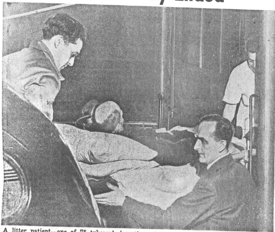
A litter patient—one of 75 tuberculosis patients being transferred from Halloran VA Hospital to Batavia, N. Y.—is lifted gently aboard a Pullman train in the Arlington yards.