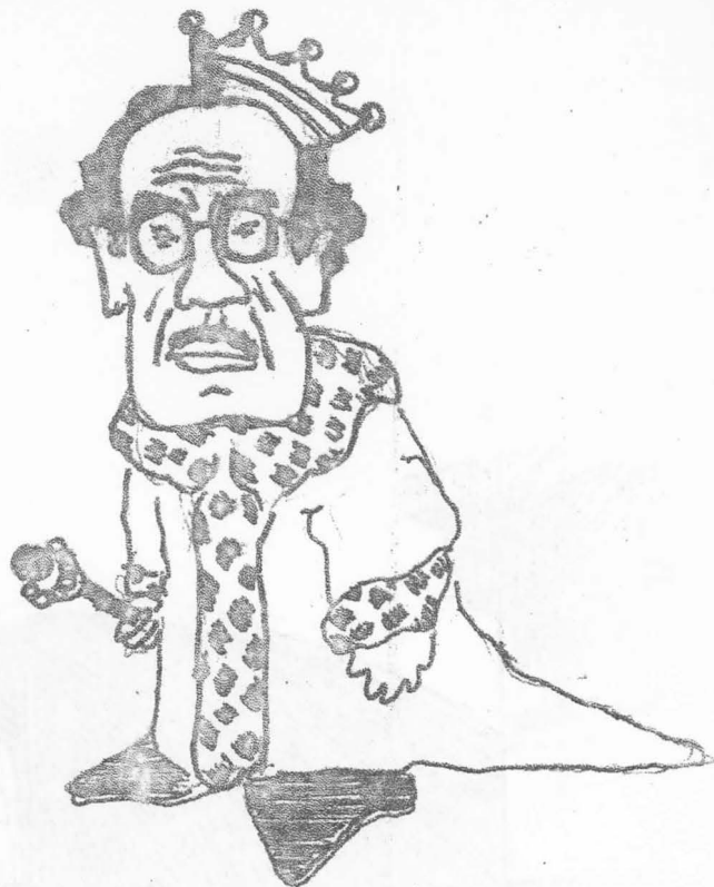
The Little King