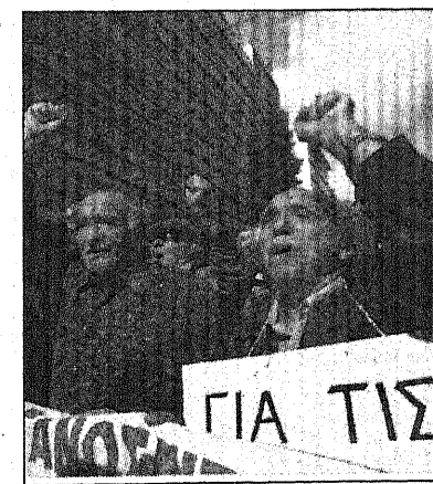
Protest admits financial troubles in Greece.