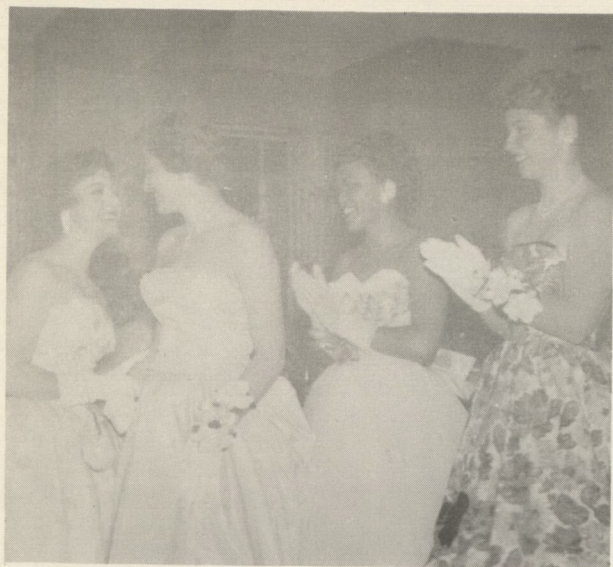
First Annual Starlight Ball