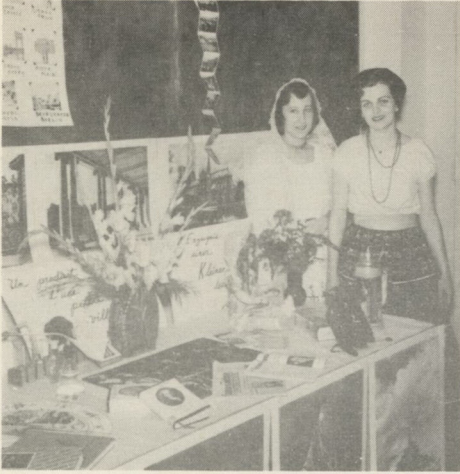
Exhibit of Social and Humanistic Studies